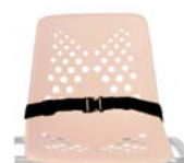
Safety Belt 2P